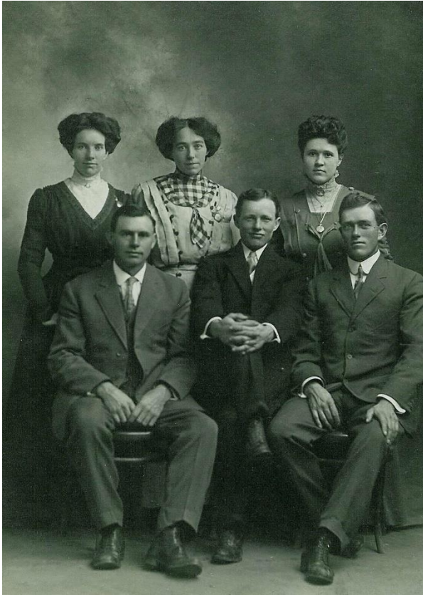
The "Magnificent Six" - Dad with sisters & spouses.

Oh happy, carefree, childhood days, Joyous laughter and baby ways, Fleeing by on wings of song, You're not a child for very long.