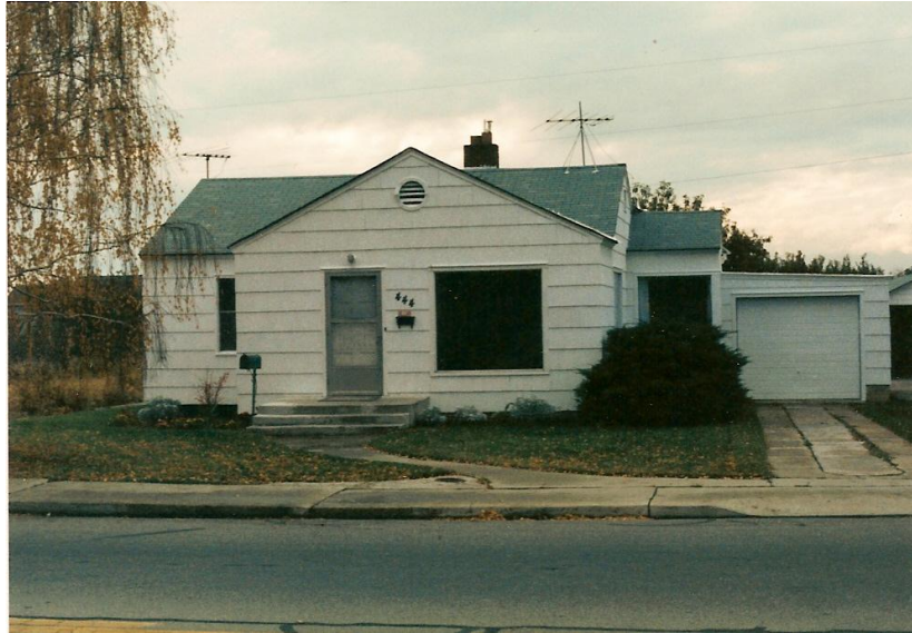
Our home at 400 South 400 West in Orem