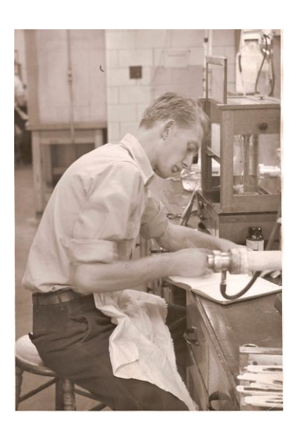
Working in the Chem Lab at Geneva Steel

During that time I farmed the ground which I purchased from my father. Many long days---eight hours at Geneva, alternating swing shift and graveyard---made it possible to work all day and all night, which I did a lot of time, much to the dismay of my family. With twenty-four acres of mainly apples, sweet cherries and sour cherries to care for I managed to keep out of mischief pretty well