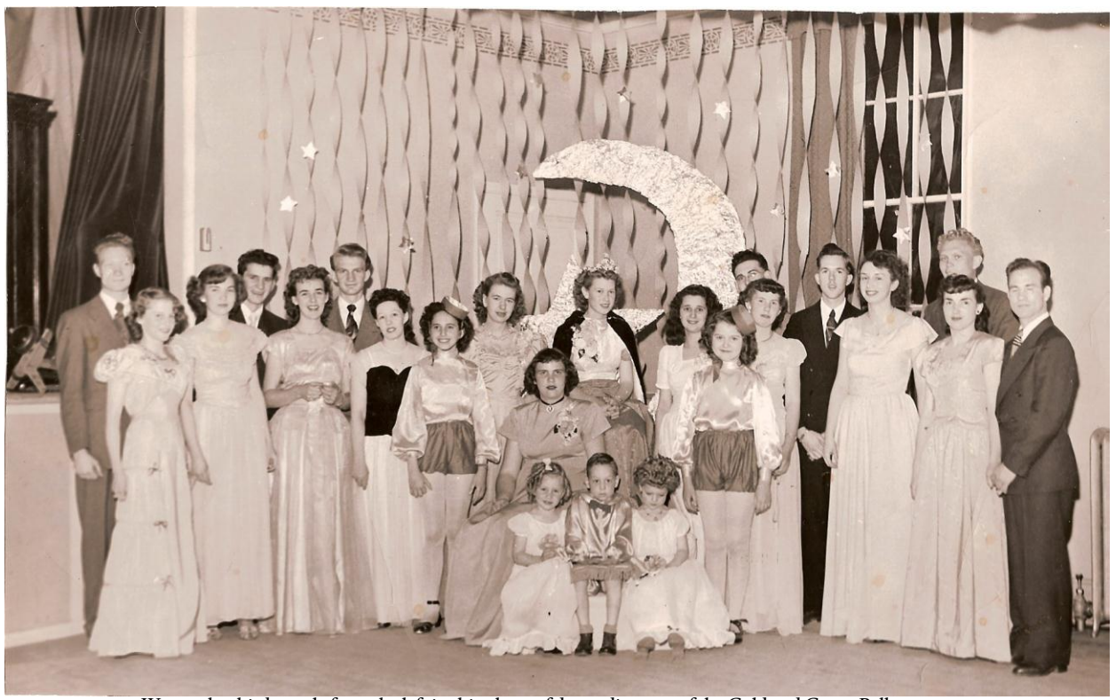
We are the third couple from the left in this photo of dance directors of the Gold and Green Ball

Perhaps a few more memories of my early years should be recounted here. In spite of the fact that I was spoiled rotten by my three sisters who were old enough to be mothers themselves when I came along---mother was 45 years old---my parents believed in the old adage, "spare the coal shovel and spoil the child." Once at about the age of four I transgressed and mother said "come here" instead I ran and she grabbed the coal shovel and ran after me. She caught me heading into the orchard and administered some good whacks to my bottom. I cried "I won't do it again, I won't do it again," and I guess I didn't because I don't remember receiving another such reprimand.