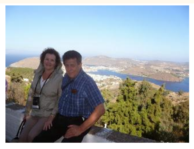
On the Isle of Patmos

Day 6: Oct. 22 – Visit other cities Paul wrote about in Revelations. See ancient ruins in Philadelphia, Sardis, Smyrna and more. Return to Kusadai.