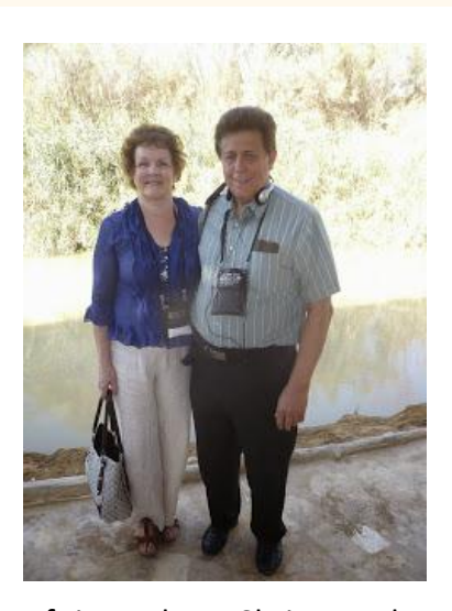
Jordan side of river where Christ was baptized.

Day 10: Oct. 26 – Amman – Petra – Amman: Travel to Petra newly voted "Wonder of the World." Walk down narrow canyon to view of the Treasury – a city carved from cliffs of the canyon. Sleep in Amman.