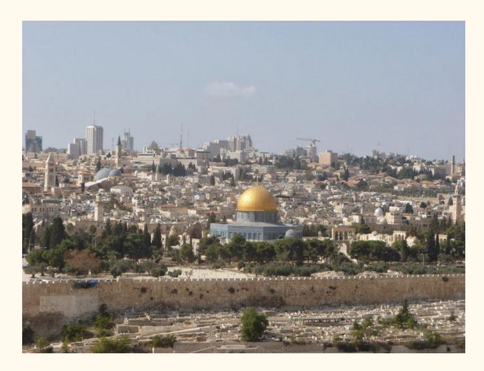
Day 17: November 2 – Jerusalem: Today the spiritual pinnacle of our pilgrimage. We retrace the footsteps of our Savior during the last hours of his life and feel the deep appreciation these places create for the sacrifice of the Son of God.

We begin at Mt. Zion at the traditional site of the Upper Room where the Last Supper was shared with devoted apostles. We visit St. Peter in Gallicantu, the possible site of the cock's crowing and the Palace of Caiaphas where Jesus was tried. From there we descend into the Kidron Valley to visit Gethsemane, the Garden of the Savior's deepest prayers. The afternoon we enter the Old City and continue the last hours of the Savior's life. We visit the Church of St. Anne where the Pools of Bethesda were located. Here Jesus commanded the impotent man to take up his bed and walk. We visit the Convent of the Sisters of Zion, the location of the Antonia fortress where Pilate tried the Savior. Out highlight day concludes at Golgotha and the Garden Tomb where we will have time to ponder the Resurrection and final triumph of Christ.