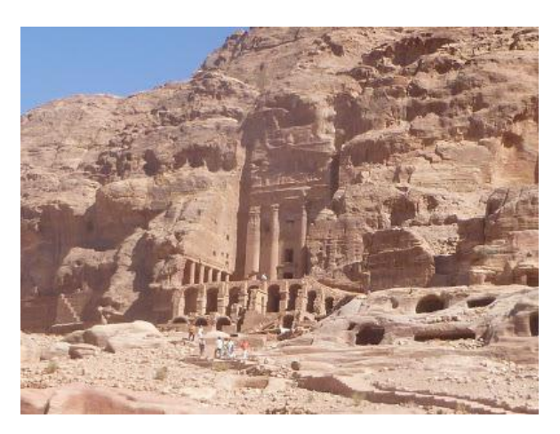
Petra - center of trade in the ancient world

Day 9: Oct. 25 – Istanbul – Amman, Jordan: Today fly to Amman, Jordan. Spend the night in our 5 star hotel.