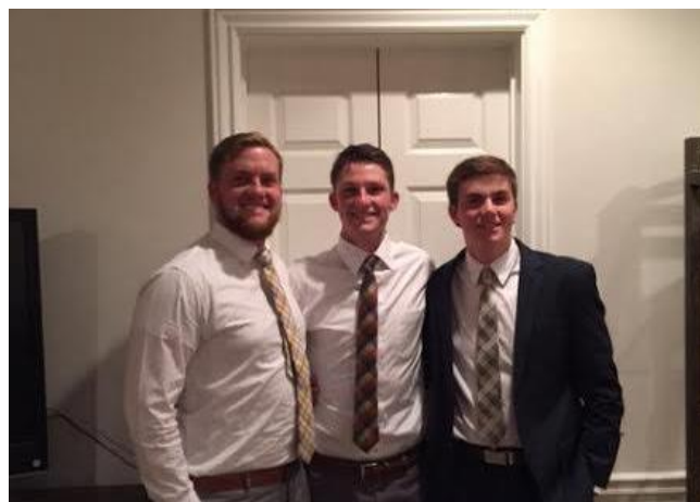
"Service is love made visible"