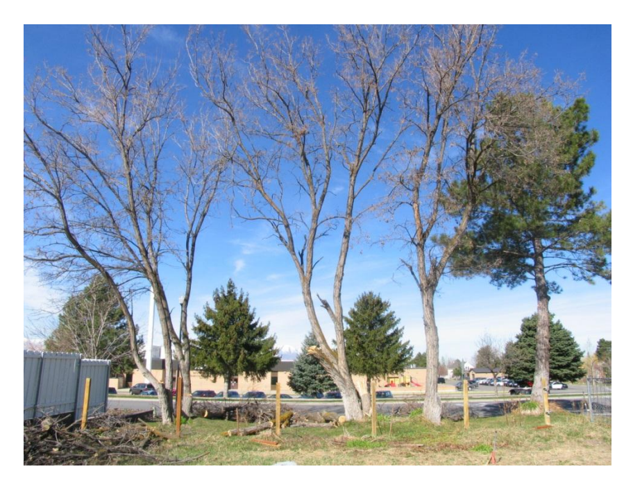
The fence had to be taken down to prevent falling trees from damaging it.